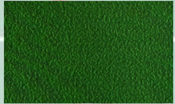
Color: Mint Green