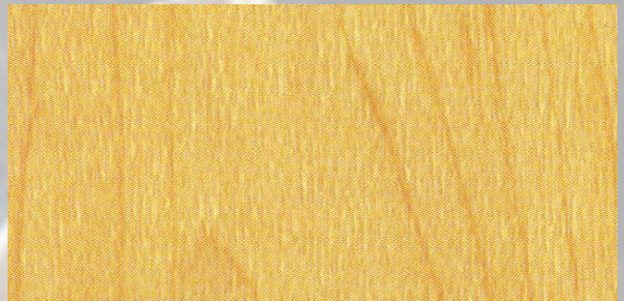
The Color: Wood grain

Surface Layer TPU moving floor high wear resistant Material have the best wear resistance and durability.